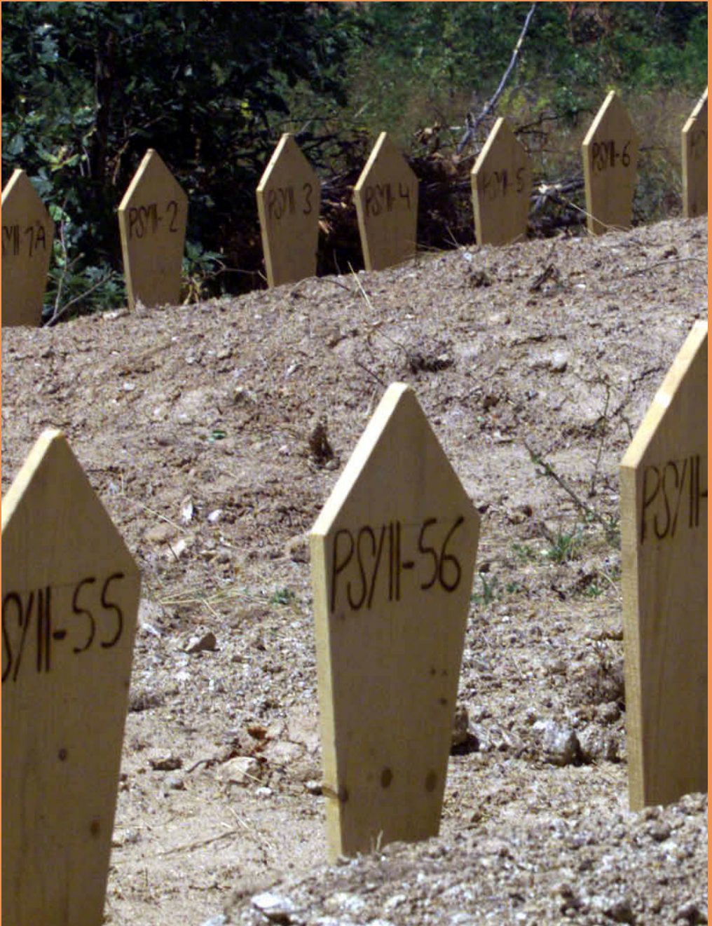
Wooden grave markers where bodies of ethnic Albanians from Kosovo were buried after they were unearthed from a mass grave in Petrovo Selo, Serbia. On Aug. 29, 2012, Amnesty International and regional Balkan human rights organizations urged the Balkan States to investigate the fate of some 14,000 people still missing from the region's conflicts and for those responsible for their disappearance to be punished.