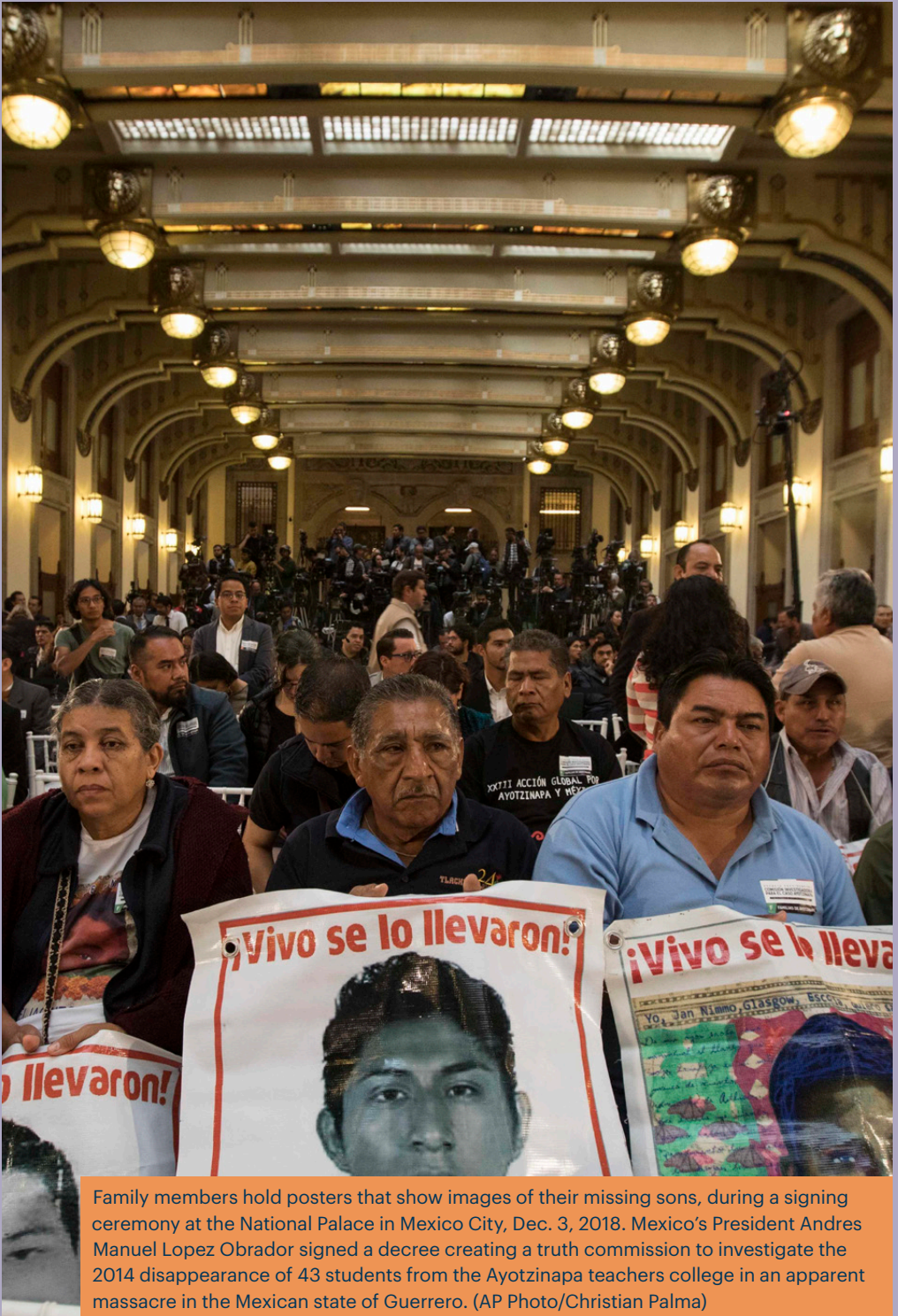
Family members hold posters that show images of their missing sons, during a signing ceremony at the National Palace in Mexico City, Dec. 3, 2018. Mexico's President Andres Manuel Lopez Obrador signed a decree creating a truth commission to investigate the 2014 disappearance of 43 students from the Ayotzinapa teachers college in an apparent massacre in the Mexican state of Guerrero.