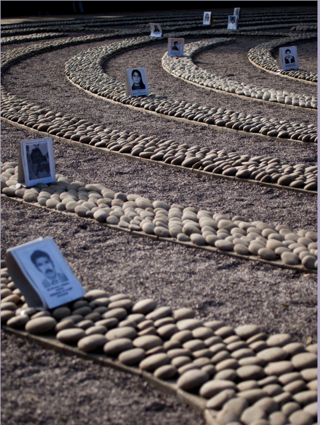
Portraits of victims stand on stones at the “Ojo que Llora” (Eye that Cries) memorial, in honor of those killed or disappeared during Peru’s internal conflict (1980-2000). Lima, Peru, Aug. 28, 2013, the 10th anniversary of The Truth and Reconciliation Commission (TRC) report.