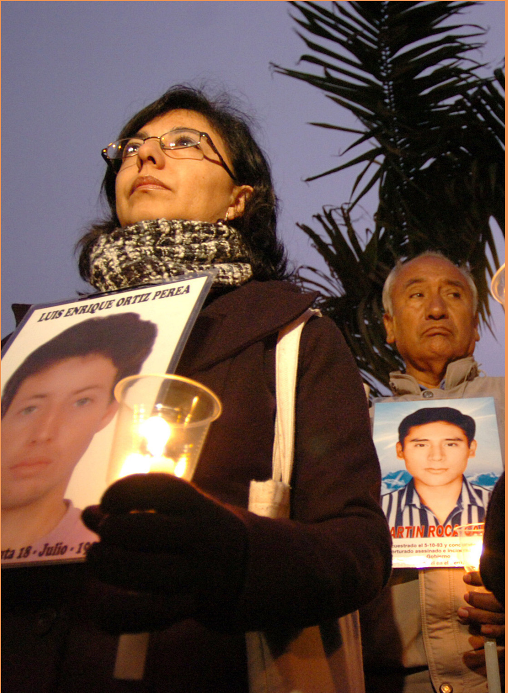
Relatives of students disappeared and murdered at La Cantuta university in Lima, during the government of former Peru's President Alberto Fujimori, hold candles at a protest in Lima, Sept, 19, 2007.