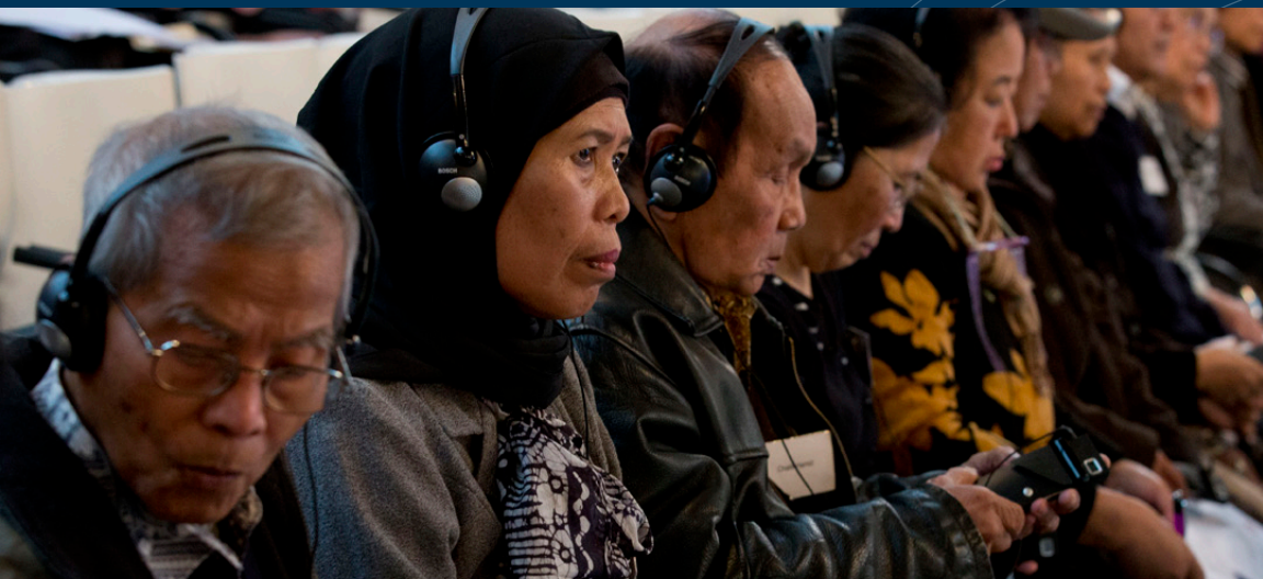
Attendees at the International People's Tribunal 1965 which opened hearings intended to publicize allegations of mass killings of hundreds of thousands of suspected Communists, 50 years ago by Indonesian authorities at the Nieuwe Kerk, or New Church, in The Hague, Netherlands, Nov. 10, 2015.

led by the Coalition, and also includes eight other partner organizations. These are: the American Bar Association's Rule of Law Initiative (ABA ROLI), based in the USA; Asia Justice and Rights (AJAR), Indonesia; Centre for the Study of Violence and Reconciliation (CSVR), South Africa; the Documentation Center of Cambodia (DC-Cam), Cambodia; the Due Process of Law Foundation (DPLF), United States; the Forensic Anthropology Foundation of Guatemala (FAFG), Guatemala; the Humanitarian Law Center (HLC), Serbia; and the Public International Law & Policy Group (PILPG), international, headquartered in the USA. As well as leveraging the expertise of the GIJTR's member organizations, the Coalition is able to draw on the knowledge base and longstanding community connections of its 300-plus members, in 65 countries, to deepen and broaden the work of the GIJTR.