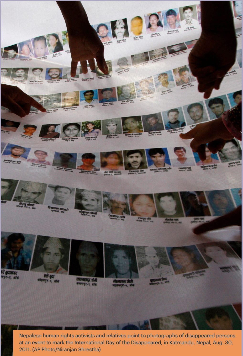
Nepalese human rights activists and relatives point to photographs of disappeared persons at an event to mark the International Day of the Disappeared, in Katmandu, Nepal, Aug. 30, 2011.