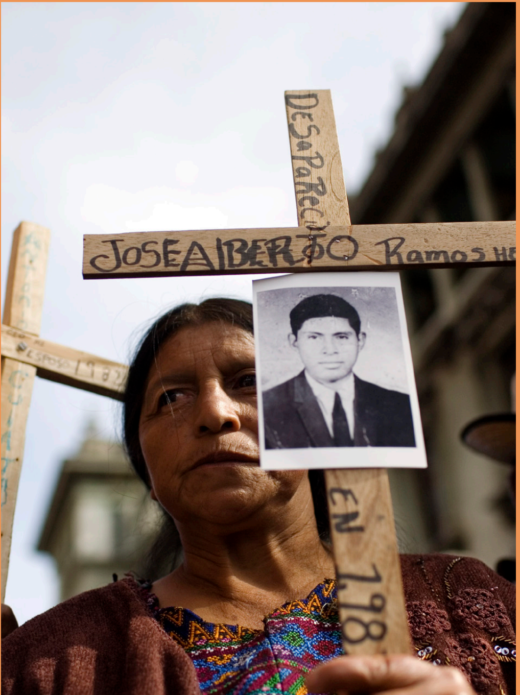
Relatives of victims of the Guatemalan Civil War (1960-1996) take part in a ceremony to commemorate the 10th anniversary of the Truth Commission report, which documented thousands of cases of killings and disappearances committed during the conflict. Guatemala City, Feb. 25, 2009.