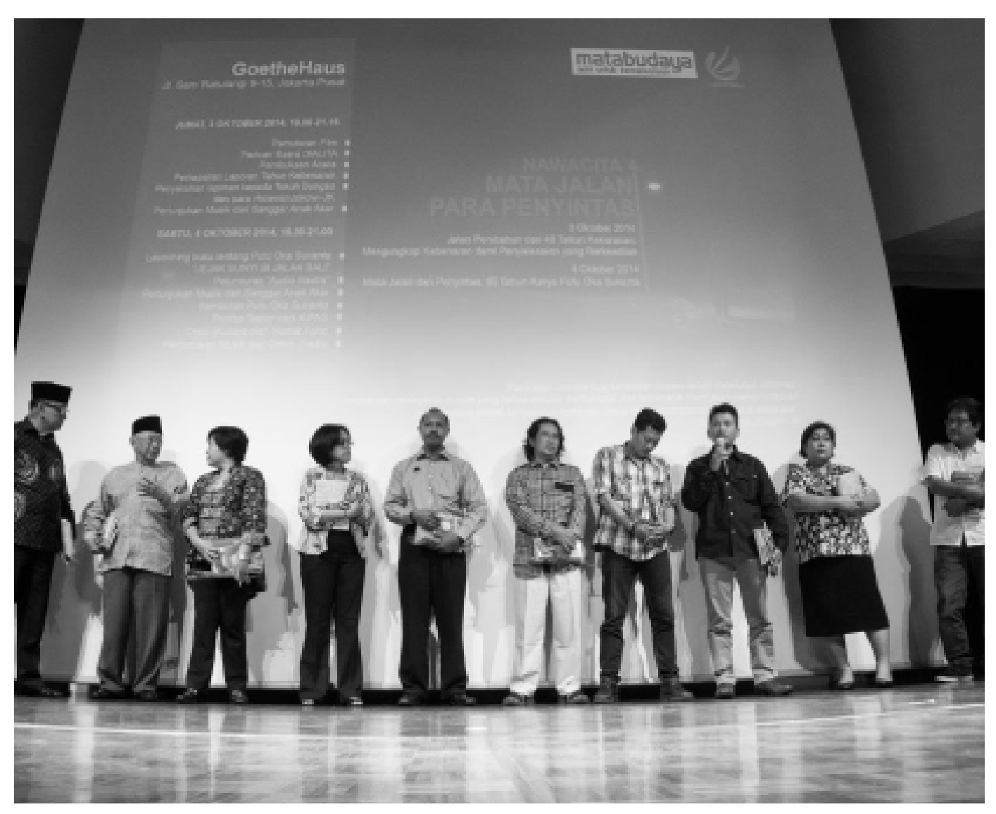
AJAR and KKPK submit a report of 40 years of violence in Indonesia, "Reclaming Indonesia", to the community leaders and representatives of government agencies on October 5, 2014 in Jakarta, Indonesia.