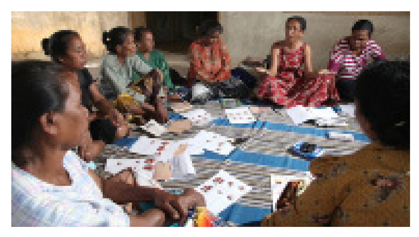
Researchers and survivors from Bobonaro, Timor-Leste conducted a healing workshop. The victims were also invited to discuss the impact of violence and unmet basic needs.