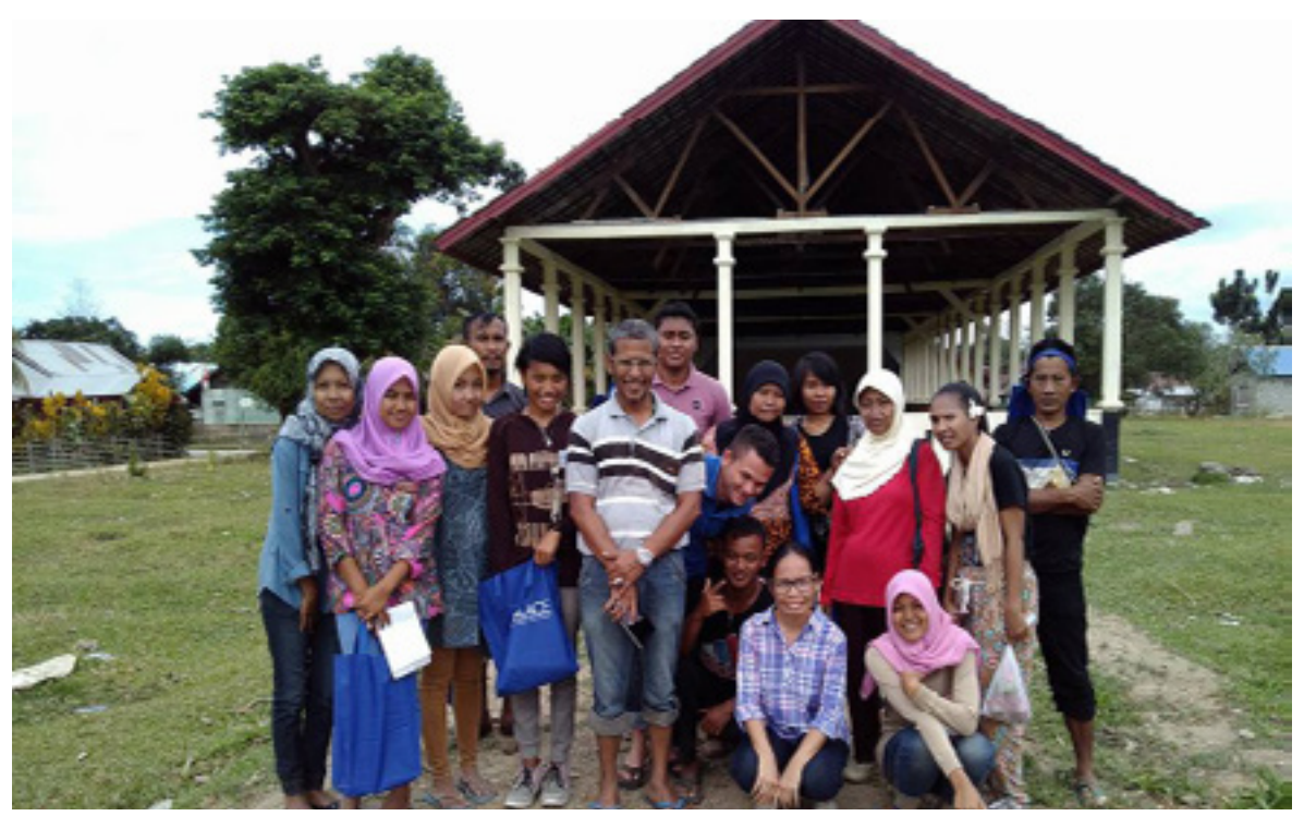
A group of youths from victim's family took part in participatory action research, held in Buru Island