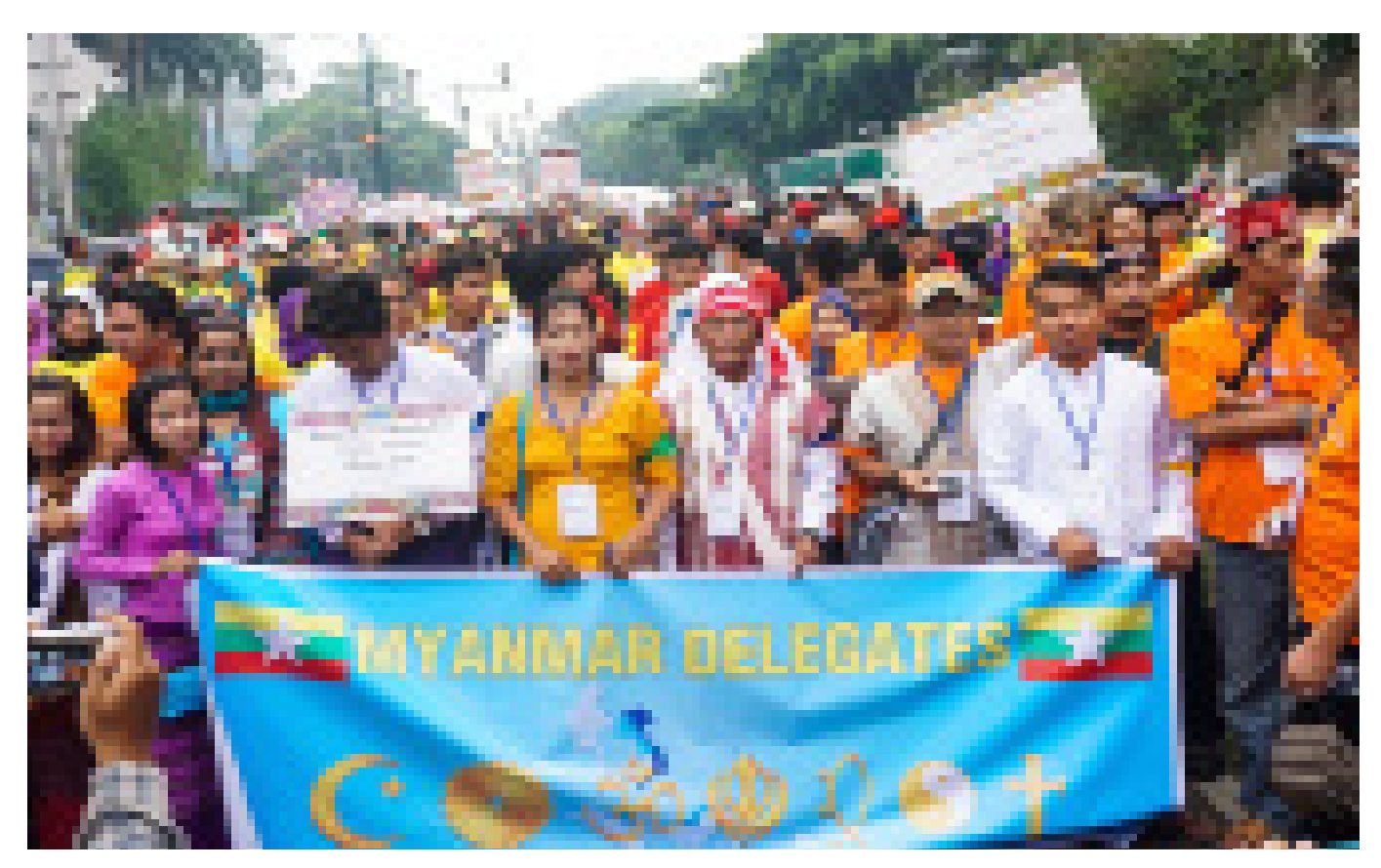
Members of minority groups and local religious groups from Myanmar participated in the commemoration day of World Tolerance Day in Jakarta, Indonesia.