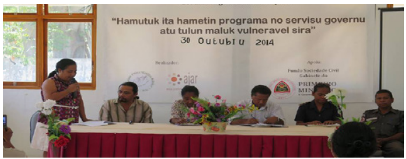
Workshop on victim's access to government social program at Manatuto District, October 2014

Following from one of the recommendations of the Chega! report, AJAR will begin a pilot project to locate and reunite Timorese adults the 'missing children', who were separated from their families during the Indonesian occupation of Timor-