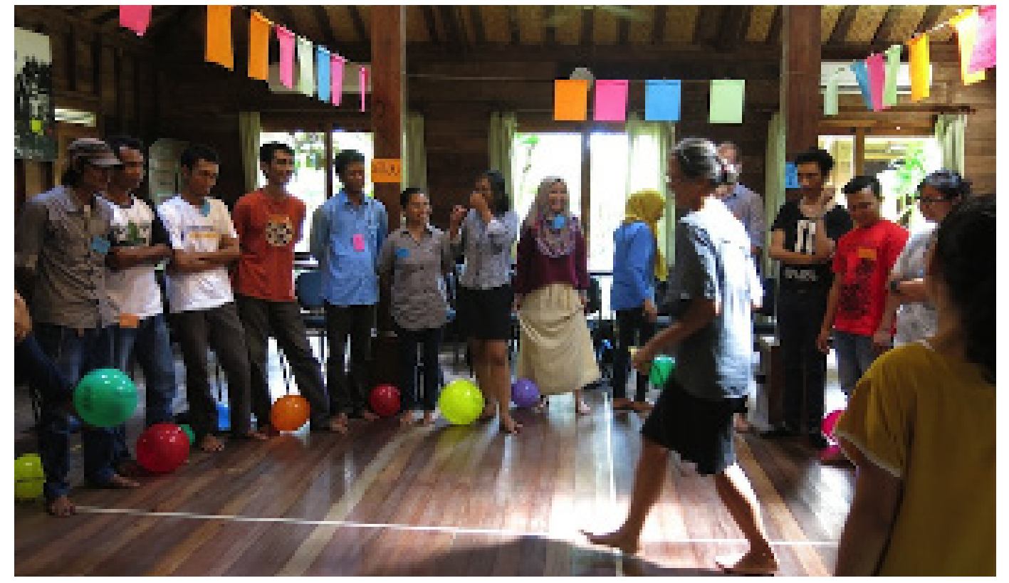
Series of training activities undertaken by AJAR, including training on gender in conflict areas, and media and human rights defenders for youth.